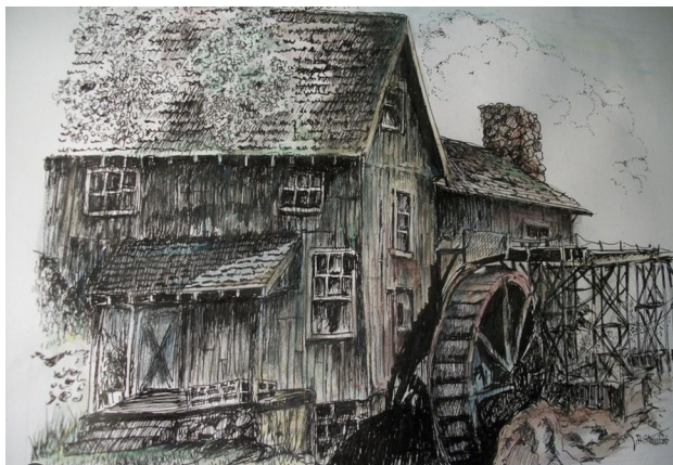
Depiction of a watermill from the turn of the 18th century. By Dick Stanton.

Having completed state and local zoning requirements and raising nearly all the funds, plans are finalized for the park. This spring, MALT staff, AmeriCorps, and volunteers (sign up! info below...) will develop trails and wayfinding signage to facilitate hiking, snow shoeing, and cross-country skiing. All this will dovetail with our primary goal of enhancing access to the historic mill sites scattered throughout the property.