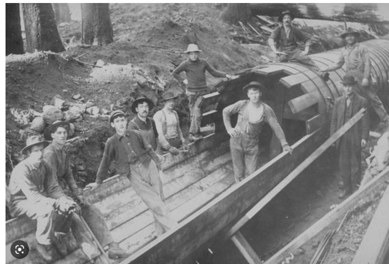
Workers constructing wood stave pipeline similar to those whose remains we see at Salisbury Mills, circa 1890