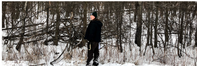
We found a deer leg caught in a tree on the Swallow Barn easement.