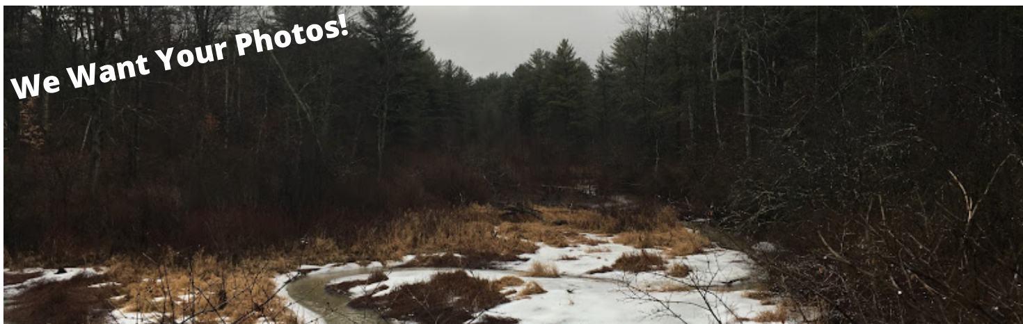
Wright Park.

In partnership with the Otter Creek Audubon Society, we are accepting photo submissions to our 2022 Phenology Calendar. This calendar will focus on seasonal change in our natural landscape, on and around MALT lands and trails. Phenology is the study of cyclical events in nature, such as flowering, hibernation, and migration. We have placed photo posts at six locations on MALT lands and trails. Submit your photos of the TAM and the Middlebury Area! We want to see what you've found during your explorations of nature.