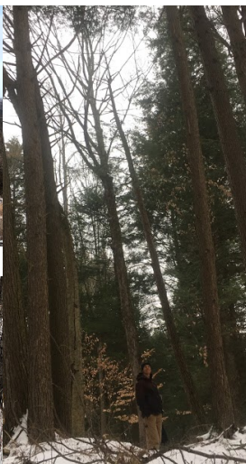
A 200 year old stand of Hemlock Trees at the Foote Farm