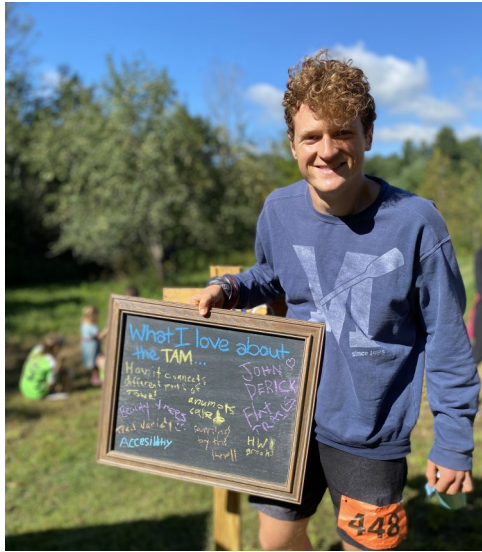
The TAM connects people with MALT lands

We couldn't do it without VOLUNTEERS 2,846 hours dedicated to MALT's mission