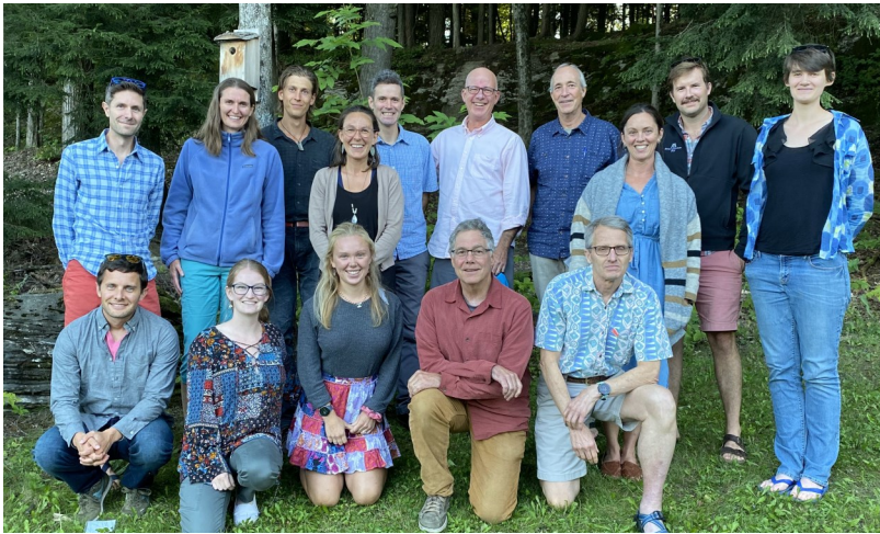
MALT Staff and Board at the 2021 Summer Retreat

In MALT's next chapter, we will connect people with the lands we protect by embarking on a NEW Strategic Plan and welcoming a NEW full-time Education Manager and TAM Trail Crew Member. The Education Manager will lead and deliver all ways MALT engages people, offering new adult and family programs, establishing a scholarship program, engaging