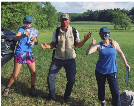
MALT's nature educators are masked up for camp

The MALT team acknowledges all those who helped us overcome challenges of unprecedented times. Together, we hosted Summer Camps, held a record-setting TAM Trek, and not only made it, but thrived. You turned to the lands and trails when you needed it most and we are proud to provide such invaluable resources to our community.