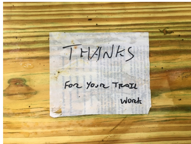
Trail fairies leave the MALT team some gratitude