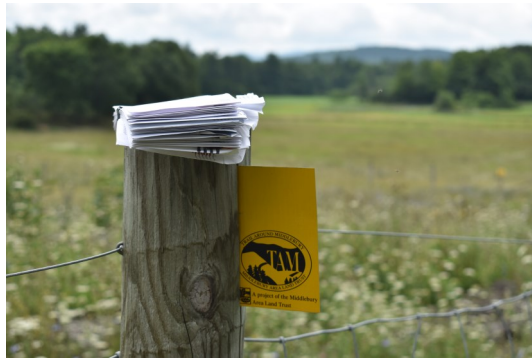
Donations to MALT make the TAM possible

A donation to MALT is a transfer of energy. Your gift represents the resources needed to conserve lands and connect people with them. Your gift is never finite because its energy continues to give as MALT brings more people to our mission.